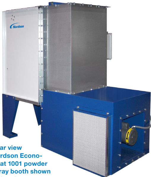
Rear view Nordson Econo-Coat 1001 powder spray booth shown with poly canopy.

Together, this package provides versatile, economical, high-performance operation to meet a variety of powder coating requirements.