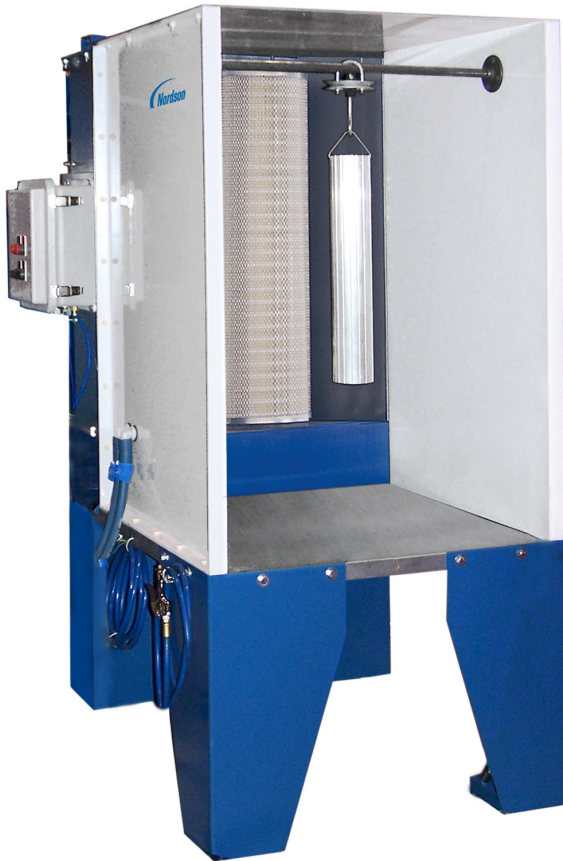
Nordson Econo-Coat 1001 booth shown with optional poly canopy.

Ultra-compact powder spray booth/ recovery system for batch powder coating