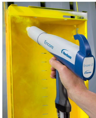
Nordson powder spray guns provide optimum coating performance.