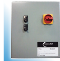
UL & ETL listed control panel