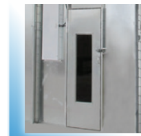
Windowed personnel access doors