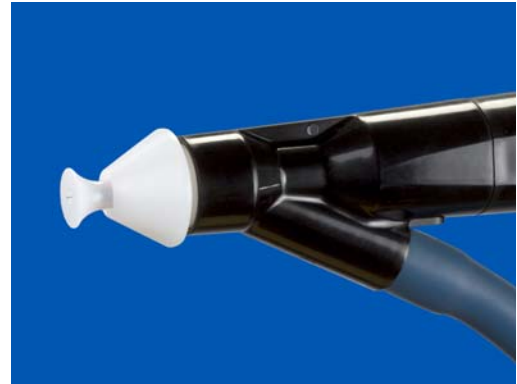
Vantage® manual spray gun provides highly efficient, flexible and reliable operation.