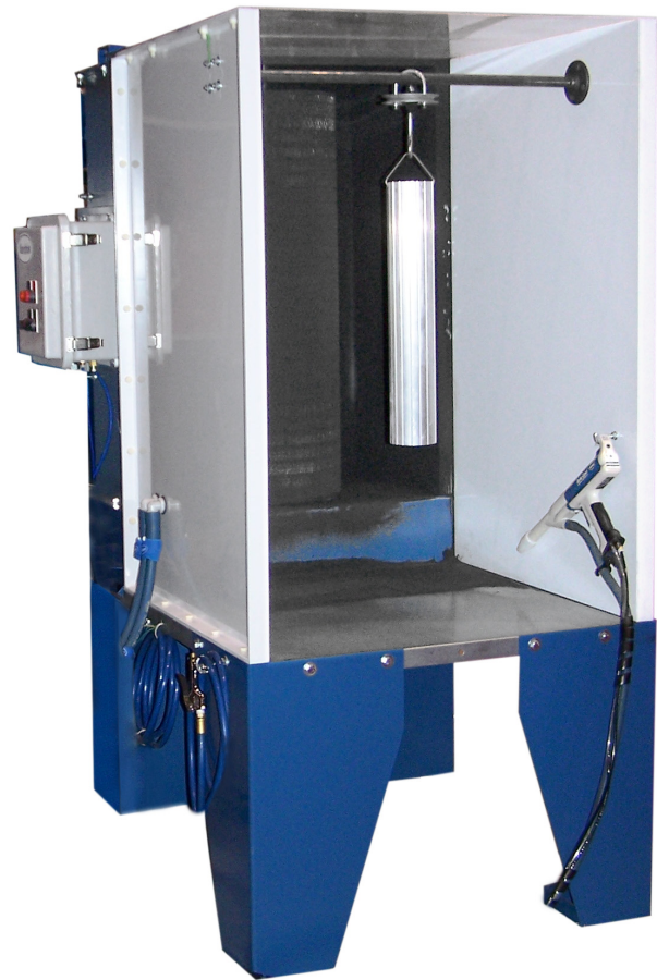
Nordson Econo-Coat 1001 booth shown with optional poly canopy and Sure Coat® manual gun.