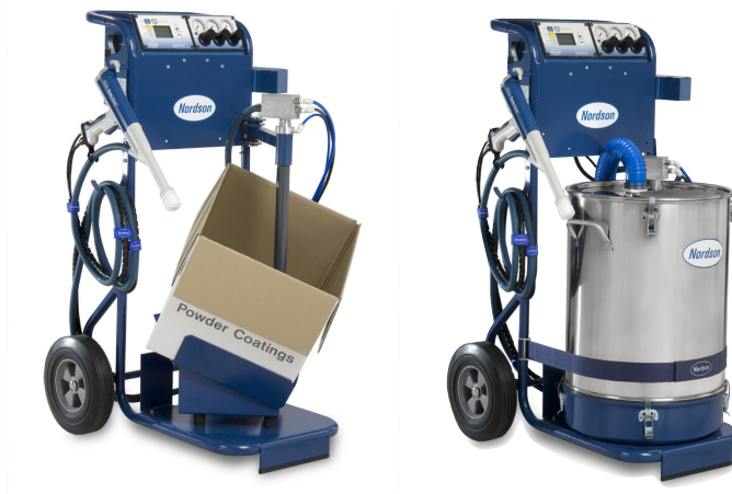
Nordson Sure Coat® and Vantage® mobile powder spray systems are the perfect complement to the Econo-Coat 1001 powder spray booth.

1 high-efficiency 36-inch cartridge filter 1 high-efficiency final filter