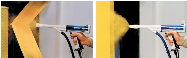
Nordson powder spray guns provide optimum coating performance.