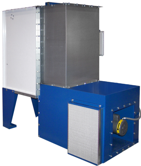
Rear view Nordson Econo-Coat 1001 powder spray booth shown with poly canopy.